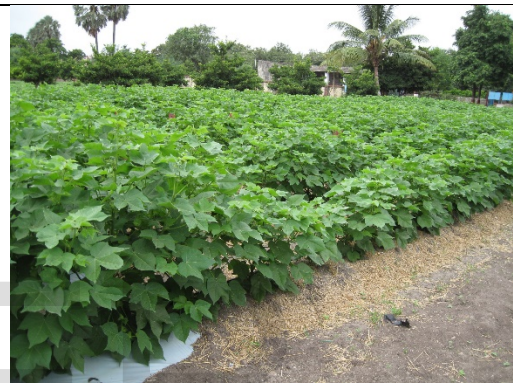
Growth of cotton in different mulch