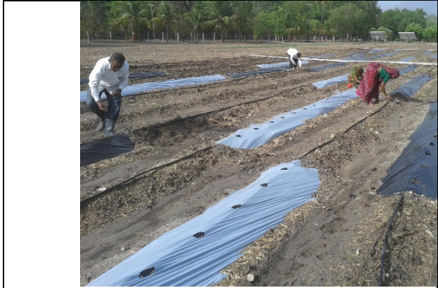
Sowing of cotton seed and solar pump