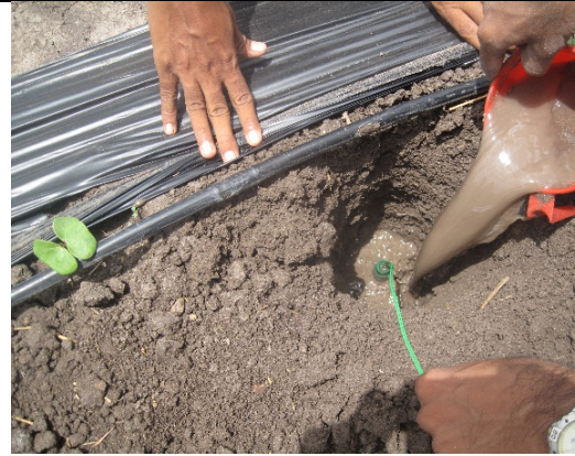
Installation of sensors